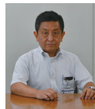
Executive Officer and General Manager Quality Assurance Div.