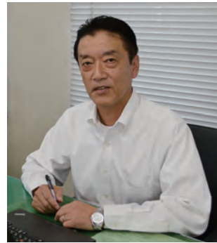
Director and General Manager Marketing & Sales Div.